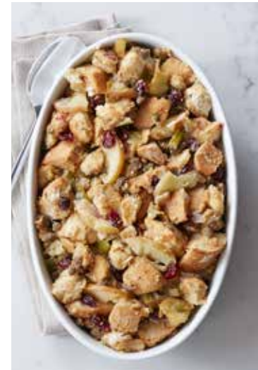
Apple & Sausage Stuffing 1.9 lbs #067003 $25