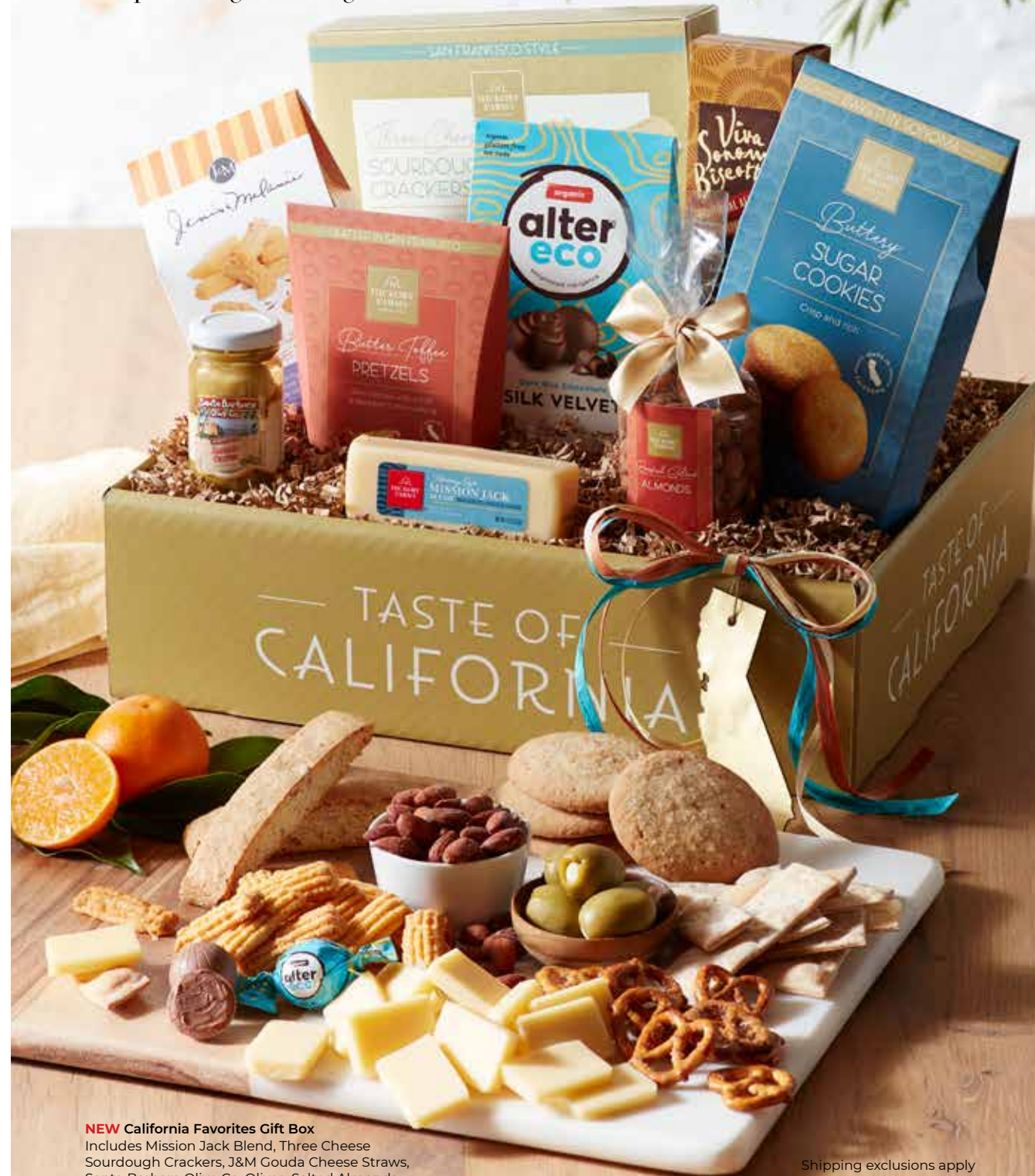
NEW California Favorites Gift Box Includes Mission Jack Blend, Three Cheese Sourdough Crackers, J&M Gouda Cheese Straws, Santa Barbara Olive Co. Olives, Salted Almonds, Buttery Sugar Cookies, Alter Eco Silk Velvet Truffles, Biscotti, Butter Toffee Pretzels. 1.54 lbs #007653 $59

A taste of the West Coast makes the perfect gourmet gift.