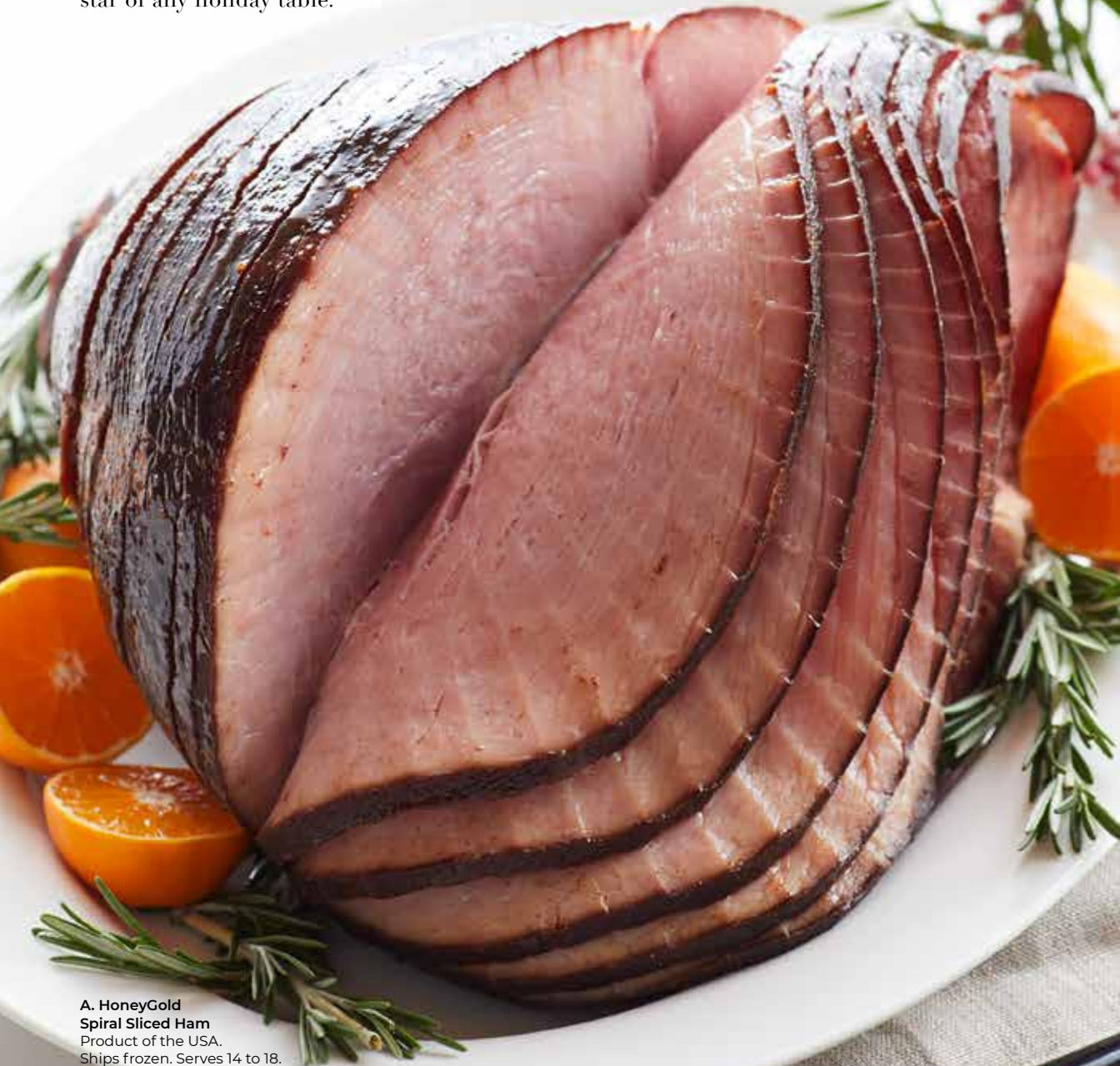
A. HoneyGold Spiral Sliced Ham Product of the USA. Ships frozen. Serves 14 to 18. 7-9 lbs. #000213 $80

Gift a meal worthy of celebration. Award-winning HoneyGold Spiral Sliced Ham, slow-cured with real honey, will be the star of any holiday table.