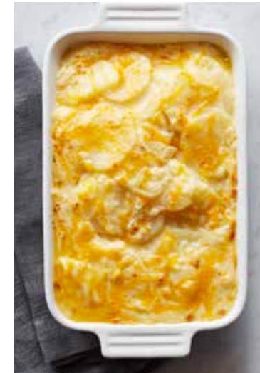
Three-Cheese Scalloped Potatoes 1.8 lbs #067006 $35