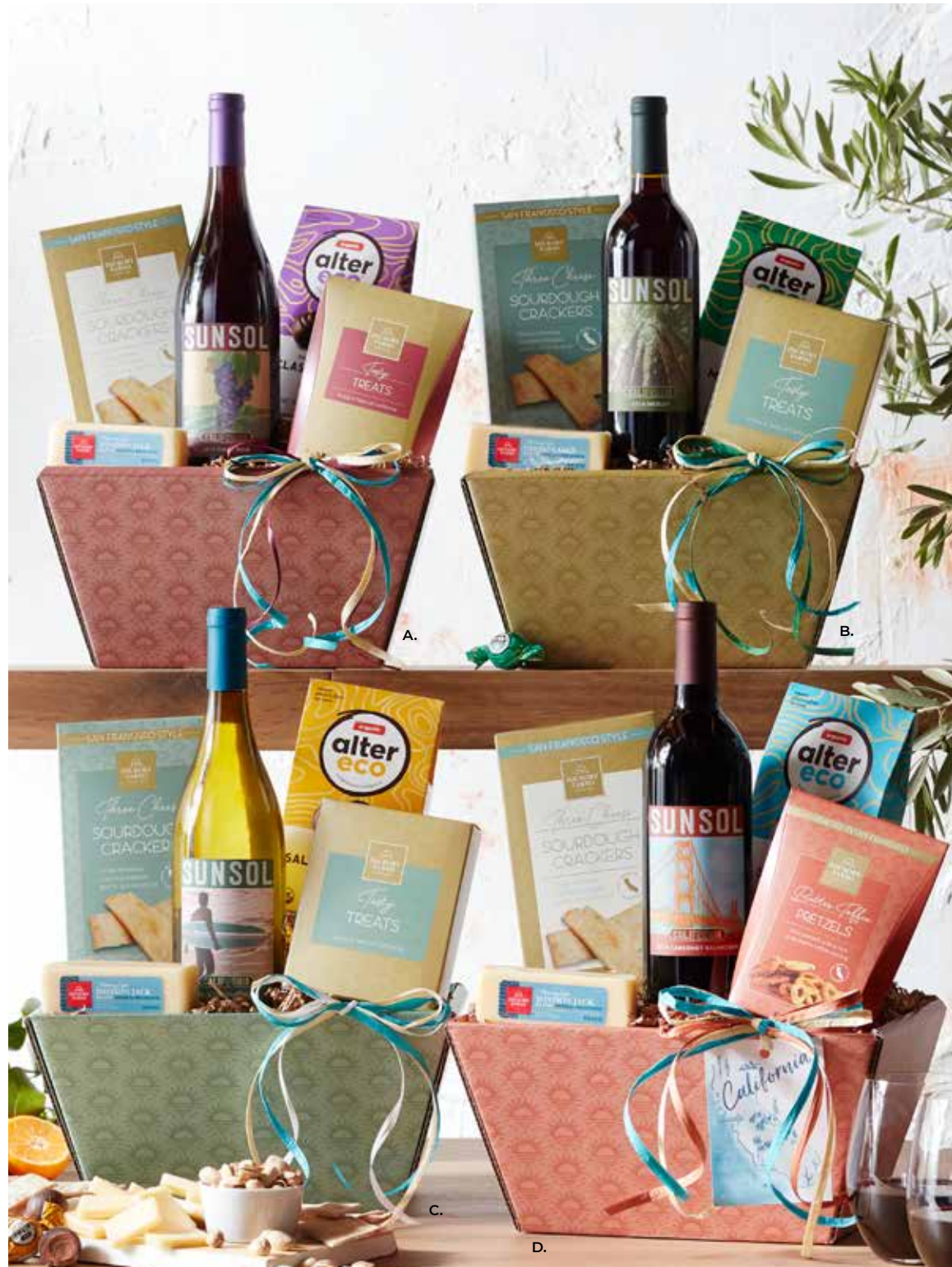
A. NEW California Pinot Noir Wine Gift Set Includes Mission Jack Blend, Three Cheese Sourdough Crackers, Pistachios, Alter Eco Classic Dark Truffles, SunSol California Pinot Noir. 2.47 lbs #007645 $49