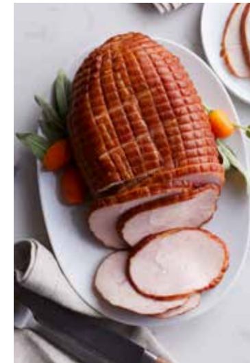
Smoked Turkey Breast 3-4 lbs. Serves 8-10. #010003 $75