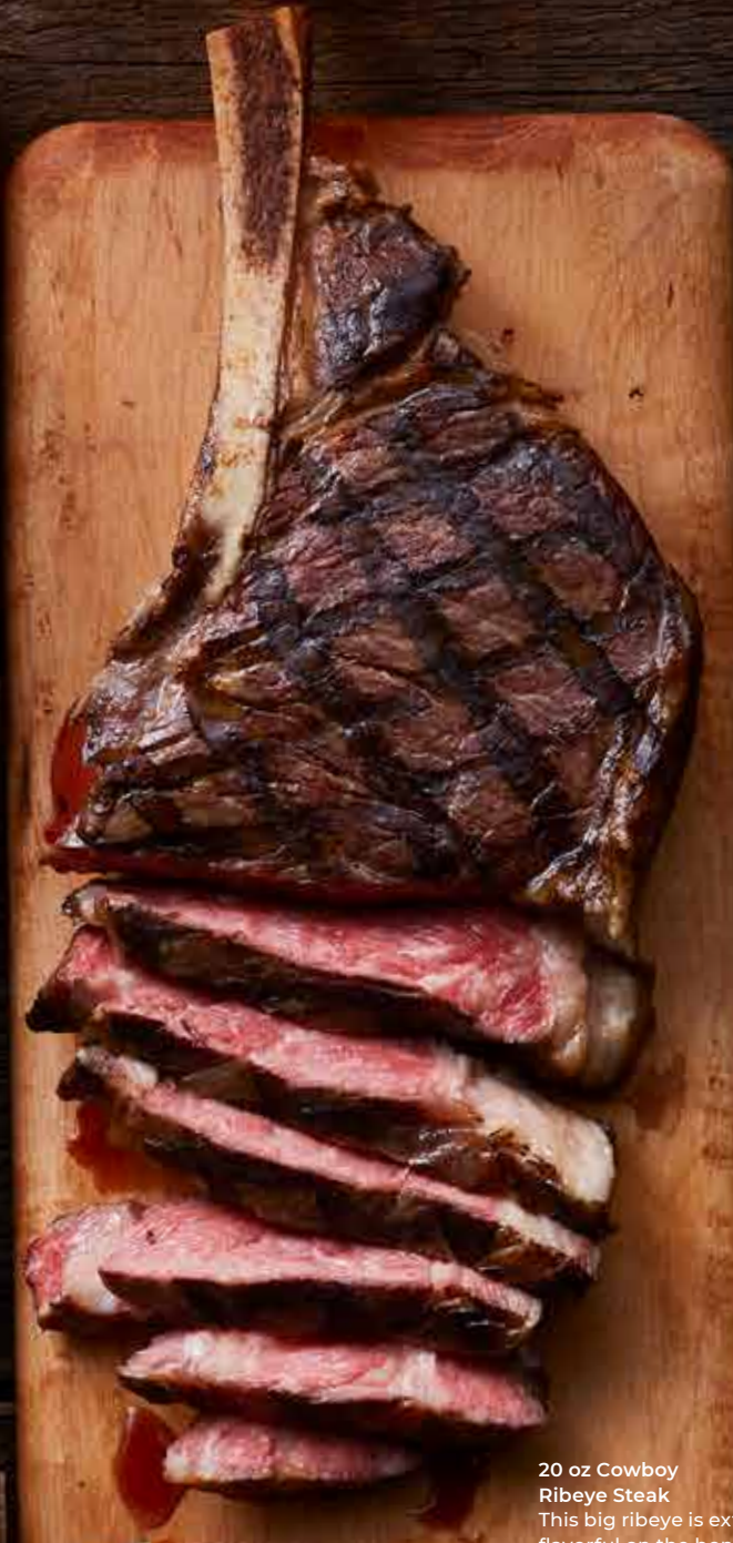
42 oz Tomahawk Ribeye Steak This huge frenched bone-in steak is a sight to be seen. Usually found in select restaurants, you can enjoy this impressive steak right at home. Product of the USA. Ships frozen raw. #061131 $125 each