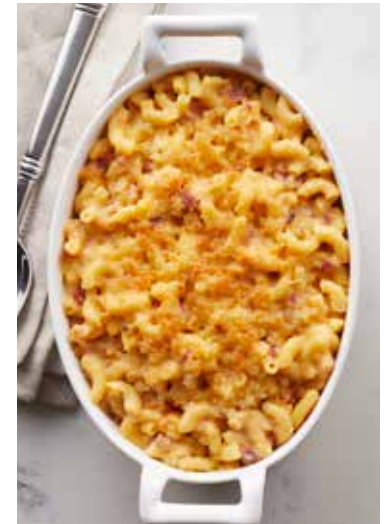
Bacon Macaroni & Cheese 1.9 lbs #067000 $29