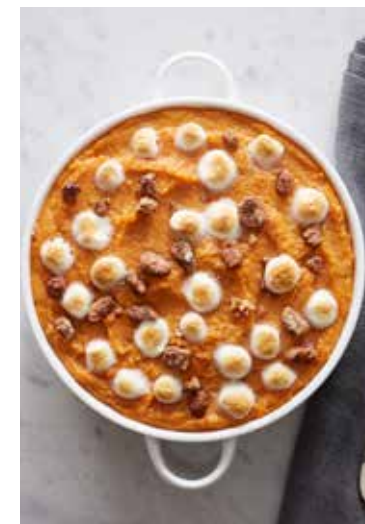
Brown Sugar Sweet Potatoes 1.9 lbs #067005 $35