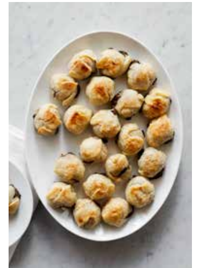
Beef Wellington Bites 24 ct #065240 $50