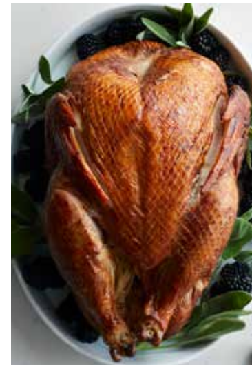
Smoked Turkey 10-12 lbs. Serves 10. #004959 $95

Premium Turkey Dinner A gourmet Thanksgiving feast delivered right to your door! Premium Turkey, Apple & Sausage Stuffing, Brown Sugar Sweet Potatoes, Green Bean Casserole, and a Chocolate Pumpkin Cheesecake to end on a sweet note. Product of the USA. Ships frozen. Turkey and sides ship raw. Serves 8-12, turkey 12-16 lbs. #063994 $205 NOW $175 Also available: Premium Turkey #004957 $65