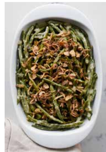
Green Bean Casserole 1.6 lbs #067001 $35